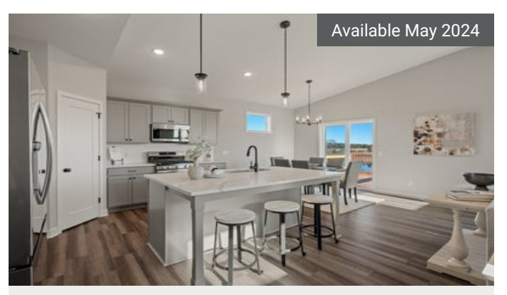
2132 Westpointe Dr Hastings, MN $474,900 The Arlow Floorplan

• Hop on Highway 55 and be downtown the Twin Cities in less than a half hour